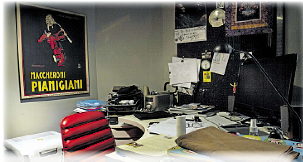
Resetting your space and getting organized before going back to school was the theme of a recent Canadian Tire storage and organization event held at a small three-floor townhouse in east Toronto.