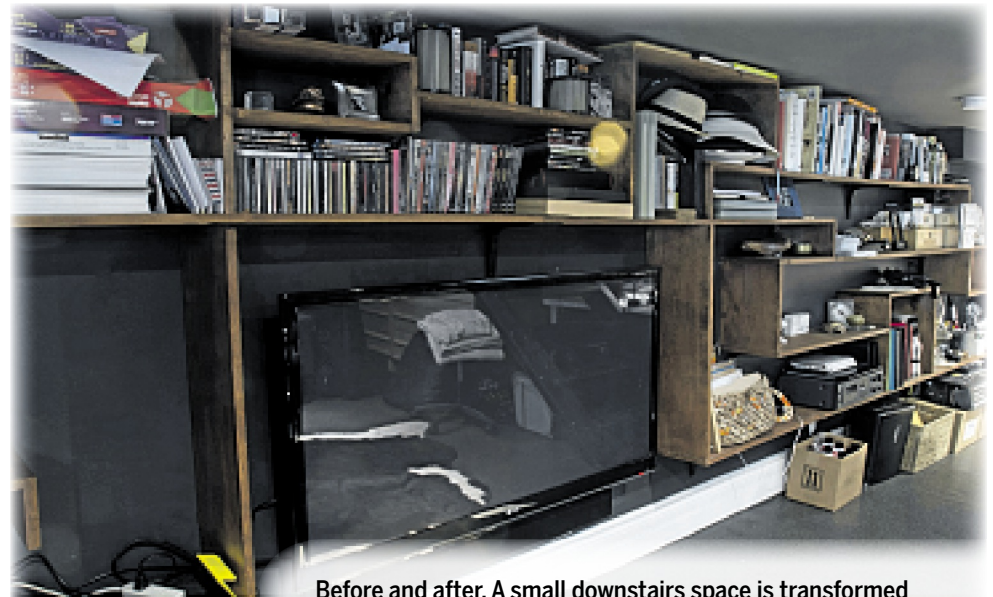
Before and after. A small downstairs space is transformed from cluttered to collected using a few quick tricks.

"Organization at the front hall is like good grooming," she says, likening it to the ritual of brushing teeth. "People think you're