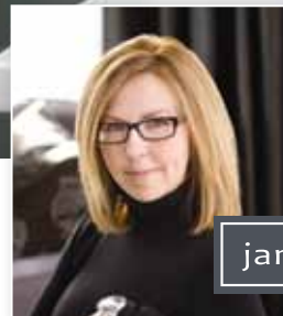
jane lockhart INTERIOR DESIGN