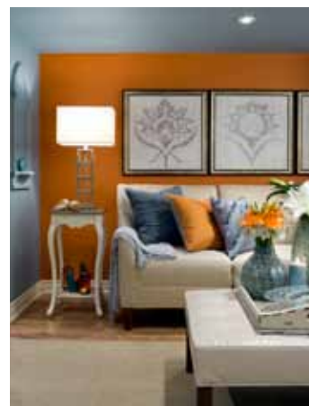
Bold colours with good lighting solutions make the perfect combination for dark spaces.

Lighting is one of the most overlooked design elements for adding life to a room. Lighting draws your eye into a space and is instrumental in creating focal points when used to highlight a specific area or item in the space. In addition, more lighting means a brighter space which is important in Canada with our long dreary winter months. Save energy and create more lighting options in your space by putting lights on dimmer switches and use LED bulbs whenever possible.