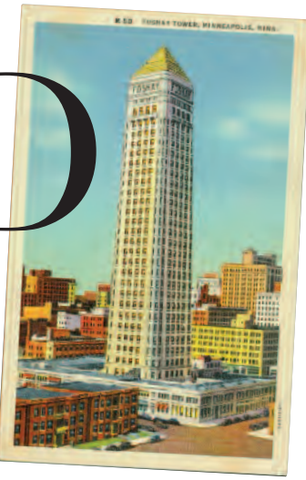
As this vintage postcard attests, when the Forshay Tower went up in 1929, it was the tallest building in Minneapolis by far.