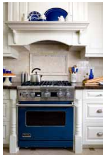
A stunning cobalt blue Viking gas range is the highlight of the space.

The kitchen renovation began with taking the walls back as far as possible to gain extra space. The layout includes all paneled appliances to keep the room warm and library-like. There are several main features in this tiny space that make it unique despite its pint-size square footage. The large range hood emphasizes the cooking area and is detailed with a mantel for plate and decorative display. The stunning blue range adds the English country style they desired with a modern touch. The Viking professional oven and cooktop becomes a very interesting element in the space, drawing attention away from the small size.