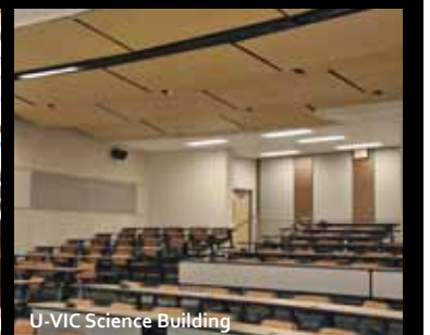
U-VIC Science Building