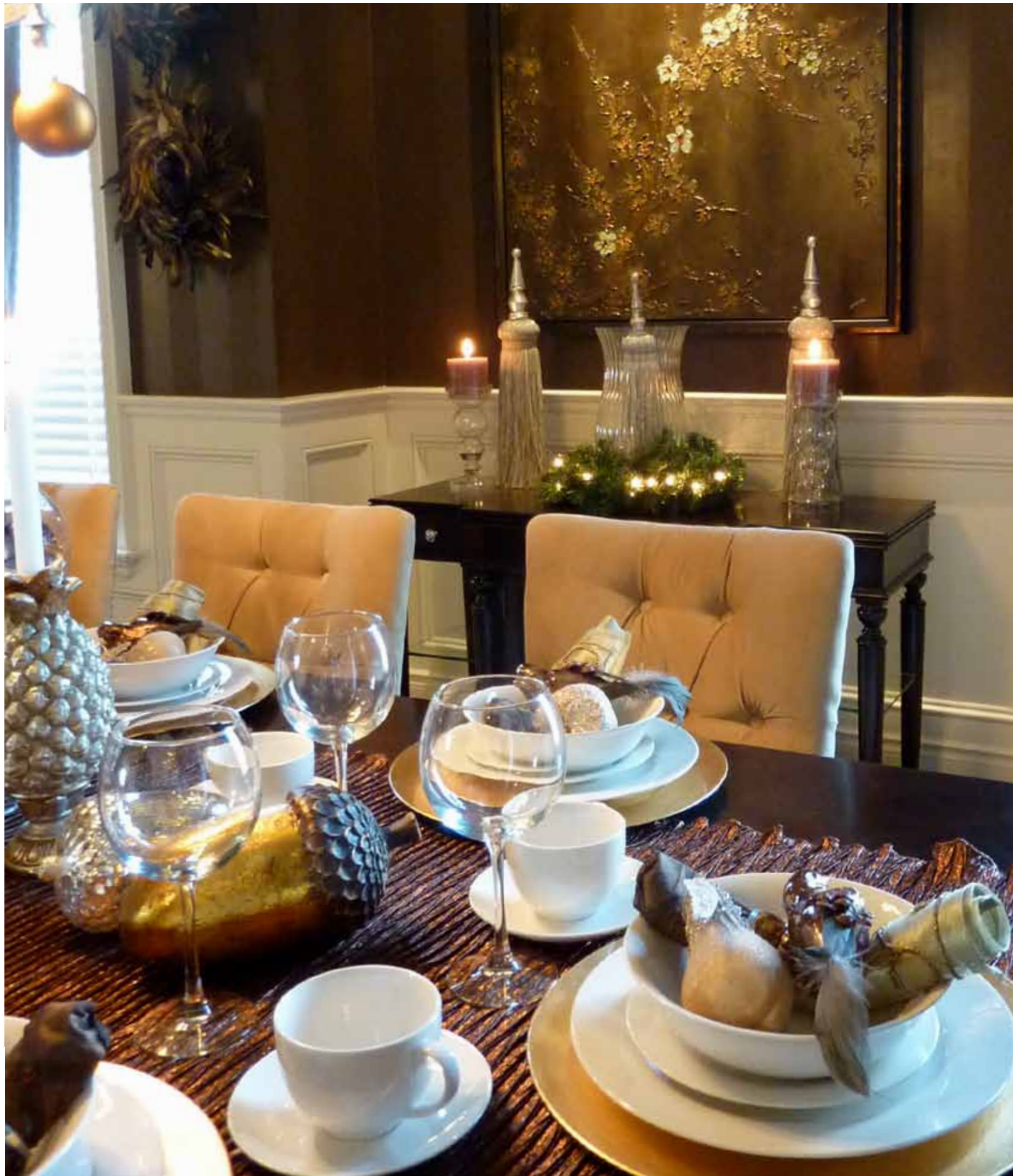
Title Page: This season create a sophisticated palette for your festive table with a mix of gold, bronze, copper and chocolate brown.