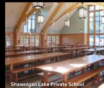
Shawnigan Lake Private School