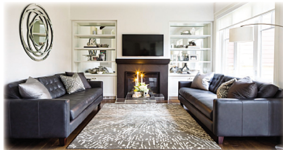
If your space always feels cold, think about investing in a fireplace.

wardrobes from summer to winter but don't always work on the front foyer or mud-room closets. Moving winter gear to the front can save time and aggravation later.