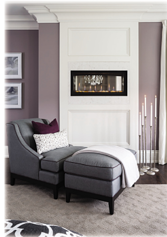
Enjoy the first snowfall knowing your home is warm and cozy.