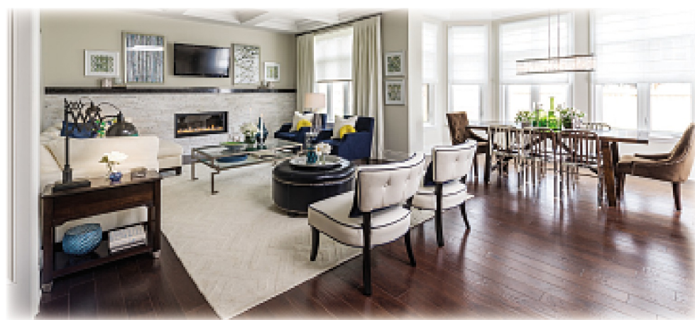
This is the season for family and friends so invest in new furniture pieces if necessary.