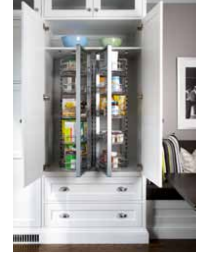
Stainless steel pull-out, swivel shelving provides valuable storage

To warm up the cool feel of the large, all-white kitchen the walls are painted a warm, deep gray with Benjamin Moore's Kendal Charcoal, a colour drawn from the island's granite top. This colour adds depth to the room and balances the white cabinets. The rich patterning of the countertop adds movement and texture to the space. More texture is added to the backsplash that features thin marble tiles laid in a random horizontal pattern to create interest at eye level.