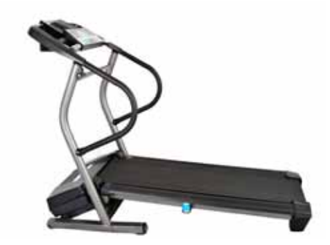
Basements have become a popular space for home gyms

In basements, a family or media room is a very popular installation. With so many advancements in technology, this space can easily become the home's entertainment headquarters where family and friends can gather for movies, music and net surfing. With today's top-quality soundproofing designed for media rooms, basements are the perfect spaces to consider for all your home recreation and entertainment