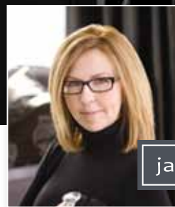
jane lockhart INTERIOR DESIGN