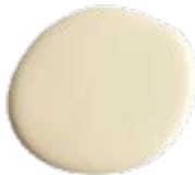
Farrow and Ball String 8: A light neutral that's stunning with white, or with medium- or dark-stained cabinets.