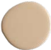
Dulux Highland Plains 41-175: A deep neutral that beautifully sets off white or dark-stained cabinets.