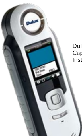
Dulux Capsure Instrument

Want to replicate a colour from upholstery, a blouse or an image in a magazine? Take a sample to your local paint store and ask them to colour match it to your favorite brand of paint. Most paint stores have the latest technology that will give you instant results at no charge.