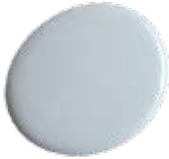
Benjamin Moore Mount Saint Anne 1565: A soft blue-grey that looks fabulous with white cabinets.

I love these soft, light colours on a kitchen wall. They create a stunning backdrop for stainless steel and white or rich wood cabinetry.