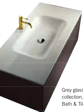
Grey glass vanity from the Artlinea collection, through Canaroma Bath & Tile canaroma.com