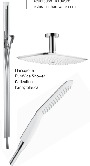
Hansgrohe PuraVida Shower Collection hansgrohe.ca