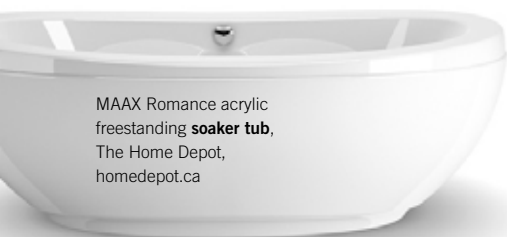
MAAX Romance acrylic freestanding soaker tub , The Home Depot, homedepot.ca