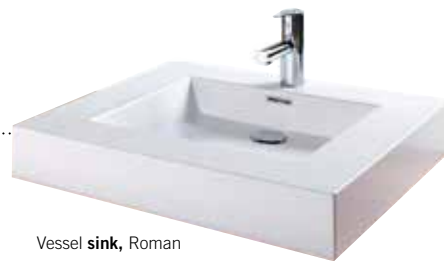
Vessel sink , Roman Bath Centre, romanbathcentre.com