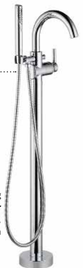
Freestanding floor-mount tub filler Delta Faucet, deltafaucet.com