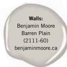
Walls: Benjamin Moore Barren Plain (2111-60) benjaminmoore.ca