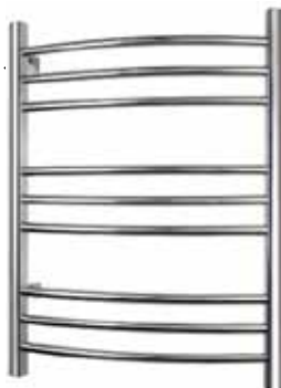
Warmly Yours Riviera towel warmer , Home Depot online only, homedepot.ca