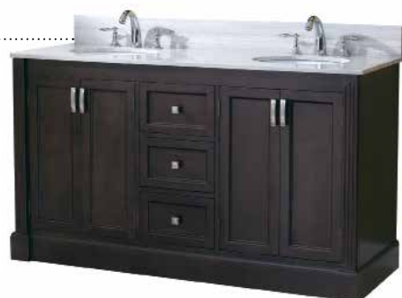
Allen + Roth Kingsway traditional bath vanity in espresso (countertop, sink and faucet sold separately), Lowes Canada. lowes.ca