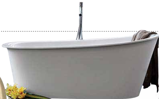
BTP 01 freestanding tub from the Tulip Collection, WetStyle wetstyle.ca

Walls: Huntington Beige HC 21, Benjamin Moore benjaminmoore.ca