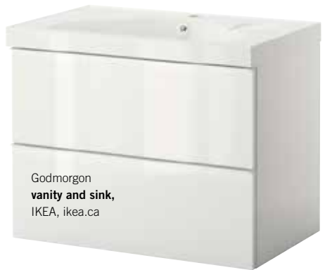
Godmorgon vanity and sink, IKEA, ikea.ca