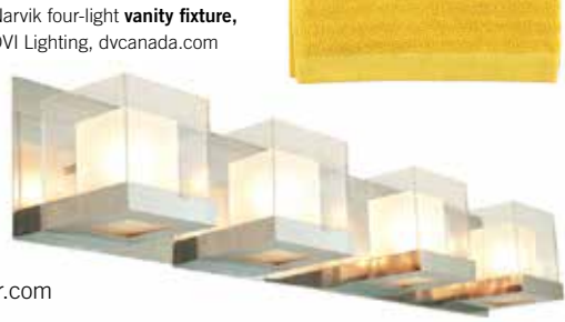
Narvik four-light vanity fixture, DVI Lighting, dvcana.com