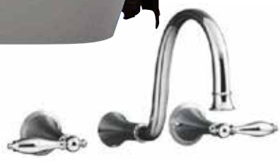
Finial traditional wall-mount lavatory faucet, Kohler kohler.ca