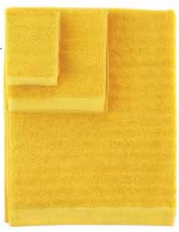
Yellow-ribbed towels Bouclair Home, bouclair.com

Custom shelves: Baby Spinach P5115-44 Para Paints, para.com