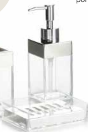
Accessories, Bouclair Home, bouclair.com