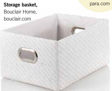
Storage basket, Bouclair Home, bouclair.com