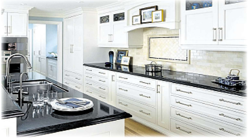
In this renovation, a new countertop increases the value of the kitchen and makes it more functional.