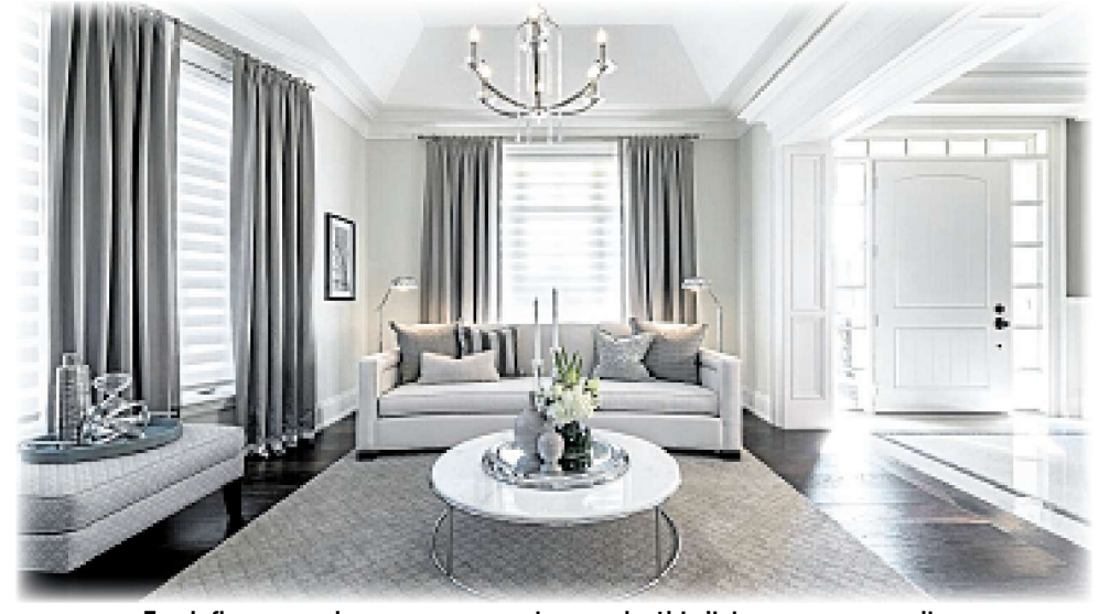
Fresh flowers and accessory groupings make this living room come alive.