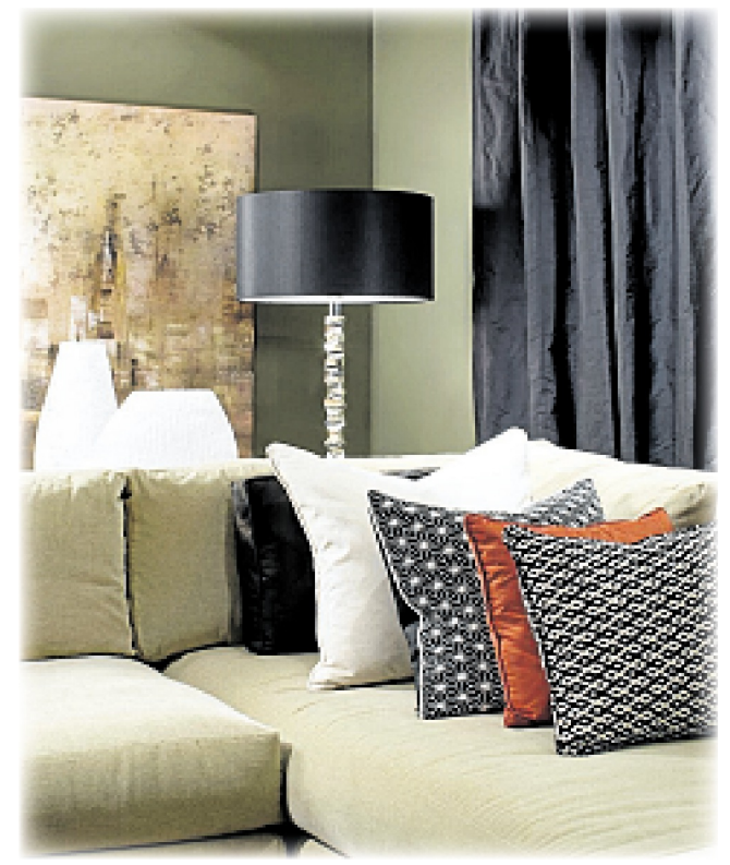
Throw pillows are a simple way to bring an old sofa or chair back to life and can also be used to tie a colour scheme together.